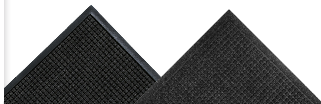
Fashion Fabric Border